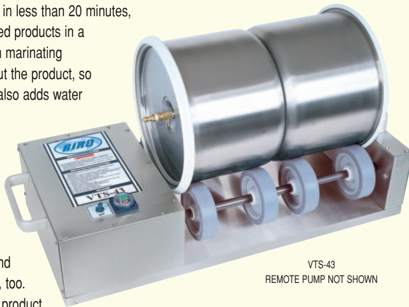
VTS-43 REMOTE PUMP NOT SHOWN

It only takes 5 minutes to load the product, water, and marinade, and it runs for 20 minutes while you do something else. When a batch is done, you only need 5 minutes to empty the drum and wash it out, and you're ready to do another batch. For even more productivity, the VTS-43 and VTS-44 has twin 20 pound (9.09 kg) drums so you can do two batches at the same time. Best of all, the low machine cost and big boost to your profit margins mean a return on your investment measured in weeks.